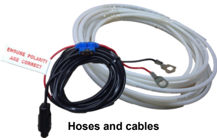
Hoses and cables

The digital cabin controller switches unit on and off; allows choice of flow rates; provides readout of flow rate and continuous volume delivered, plus total for job. Features include audible and visual no-flow and communications lost warnings, and diagnostics tools.