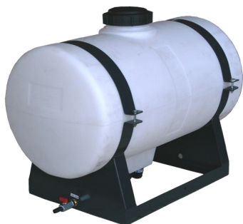
Opaque Poly Tank

All components are very high quality, offering accuracy, robustness and long life. Specifications are subject to change without notice.