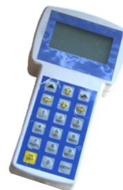
New Digital Wireless Cabin Control Unit

Contains positive displacement liquid pump with maintenance free motor, air compressor, regulator, in-line filter, wireless control unit, flow sensor and quick connect power plug. Features Perspex cover to enable viewing of components without need for removal. Fitted to tank frame for ease of installation.